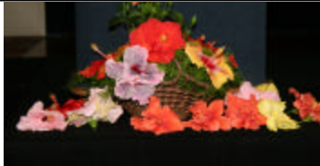
Hybrid hibiscus blooms from a display at the Berne Davis Honorary Service Award luncheon