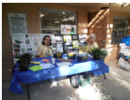
Over 14 clubs and societies participated in our annual Open House.

Garden Club of Cape Coral and their information booth