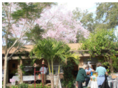
Floss silk tree brightens the Garden Council Headquarters building .