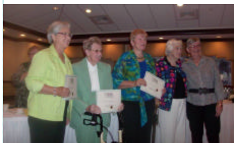
Council judges share accolades for their designs.